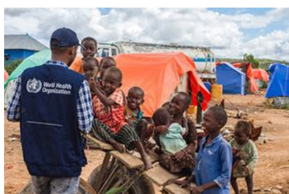
Health and peace: Concepts and tools for frontline workers