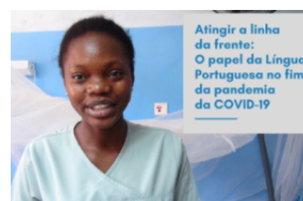
Junte-se a nós num webinar para celebrar o Dia Internacional da Língua Portuguesa a 5 de Maio Registe-se aqui